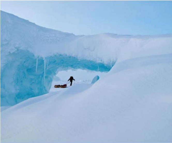
NORTH POLE EXPEDITION: MARCH 21, 2009, DAY 20

Wind: 10-20 mph Temp: 42-52°F Precip: 0-10"